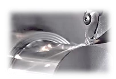
* CNC TURNING UP TO Ø29"