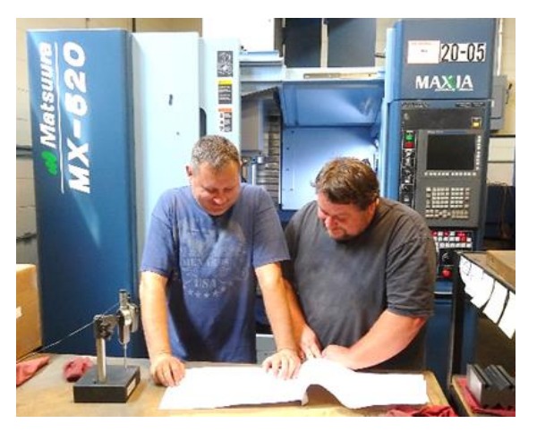
Our Professional Management Team & industry-leading Precision Machinists handle your most complex requirements