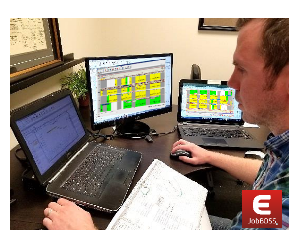
Our Production Scheduling & Supply Chain Department is always in control with our powerful JobBOSS ERP system