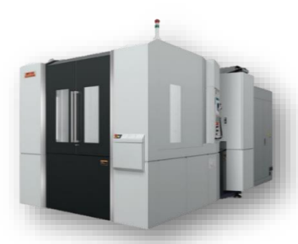
MORI SEIKI NH8000 DCGII