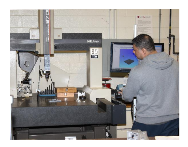
Our state-of-the-art Quality Control Lab with advanced inspection equipment to ensure high-quality, precision parts