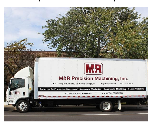
Our fleet of vehicles delivers products to you on-time, every time