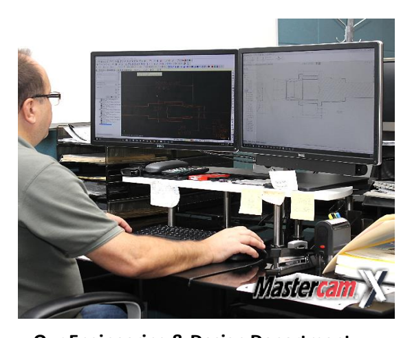
Our Engineering & Design Department is trained on the latest Mastercam 2018 CAD/CAM Multi-Axis Technologies